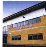
Petre Dental Surgery

Petre Court Clayton le Moors Accrington 01254 388333 reception@petredental.com